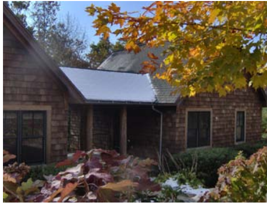
October snow coated roofs and briefly blanketed gardens at the Forest Refuge.

At the Forest Refuge , there are spaces for a personal retreat from January onwards. Since the Forest Refuge is much fuller now than in its early days, it is considerate to plan your retreat dates carefully and to commit to the time for which you sign up. Please keep in mind that if cancellations are made too close to the day a room has been reserved for you, it is often too late for those on the wait list to make last-minute arrangements to come.