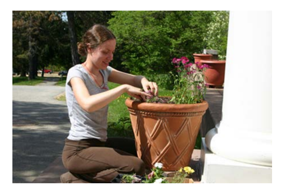
Wishing You Well

Please spread the word as we are eager for all these positions to be filled as soon as possible.