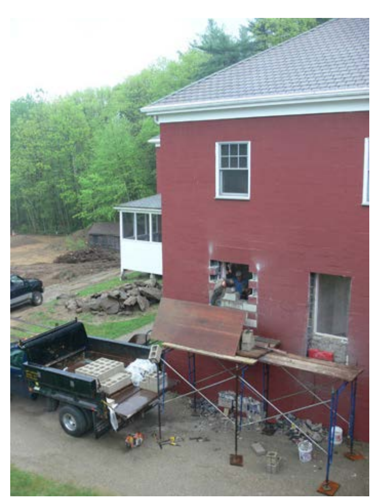
Preparing the Annex for the covered walkway that will connect all three dorms to the rest of the Retreat Center facility.

Front Entrance Accessibility - For those of us with mobility issues, entering the Retreat Center's main building can present a challenge. It means either negotiating the