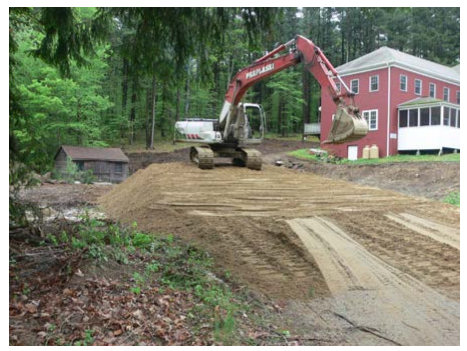
Building up the foundation for a new access road on Retreat Center grounds. This will serve for dropping off luggage at the new dorm and Annex, as well as for delivery and emergency vehicles.