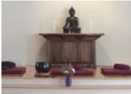
Late last year, a beautiful new walnut altar (above) was installed in the Retreat Center meditation hall. In harmony with the peaceful colors and lines of its surroundings, it now gracefully supports the statue of the Buddha and relics of his disciples Sariputta and Moggallana.