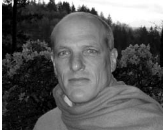
Careful listening has always been for me a mindful experience of impermanence.

One of the many interesting places this leads is towards understanding the constructed nature of our issues with such things as race, ethnicity, gender and power. With interpersonal meditation, the nature of our constructs of self and other become very clear, just as in personal meditation our self-constructs become clear. One sees