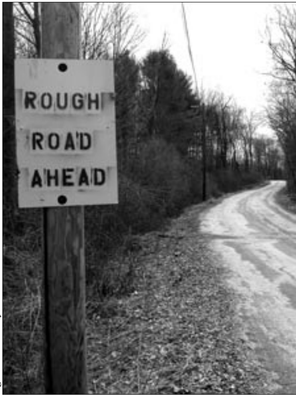
Sign near the study center