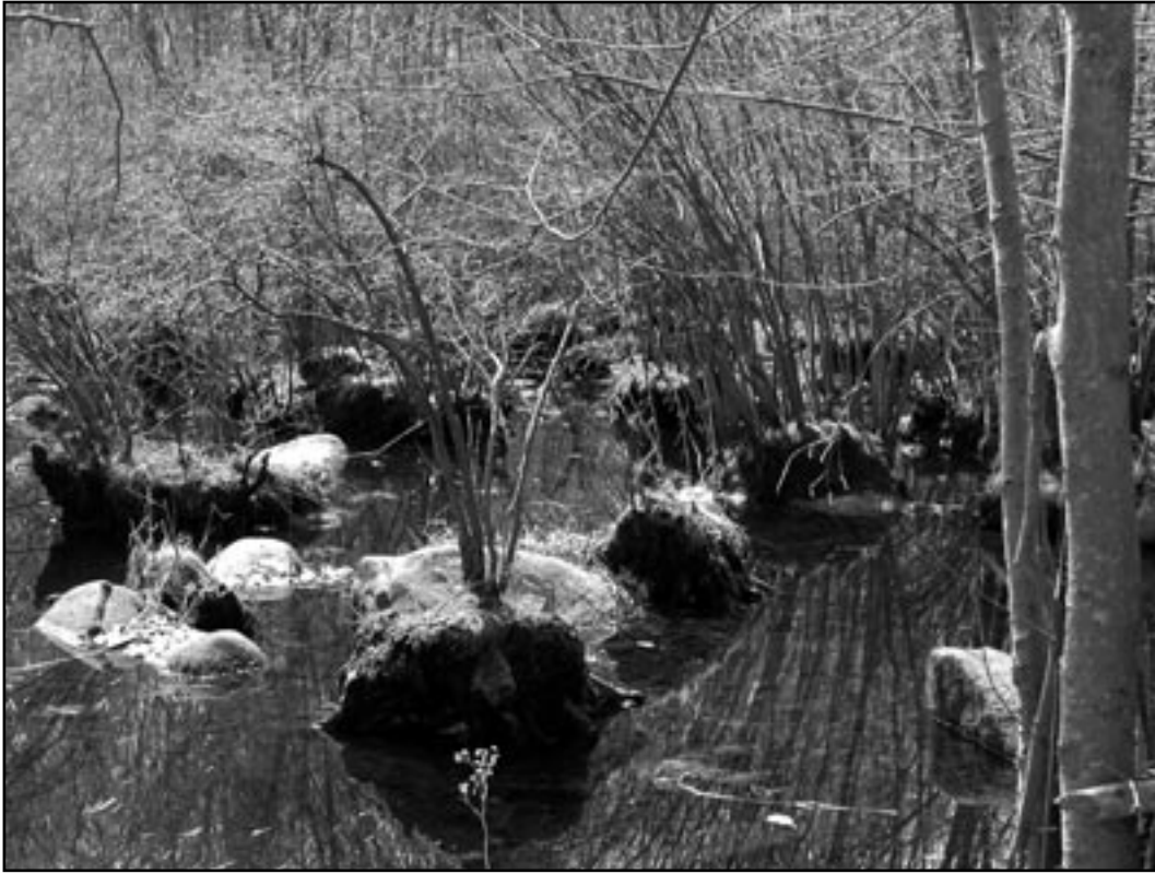
New England Zen garden (marsh on a road near the study center)

state that is actually very natural to us. We just haven't trusted it enough to simply be there. We feel assaulted by the world and feel the need to construct these various self representations, and to some extent of course that's true. But then we buy into and believe we really are these selves we have constructed in relationship to our circumstances as we grow up in this world. We need a kind of trust in something greater than anything we have yet imagined, because this isn't going to be something we can or necessarily even want to imagine. This is going to be something we enter into through the direct experience of our practice, without knowing ahead of time how it is going to be.